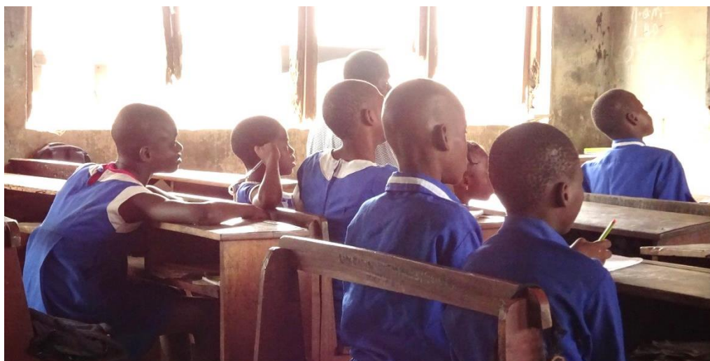
Photo: children with and without disabilities engaged in mainstream maths lesson, Ojuwoye School, Lagos

Co-teaching large classes can be a useful strategy for delivering more inclusive and child-centred teaching in settings where infrastructure and teachers are stretched.