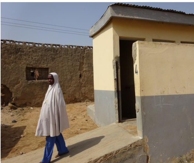
Photo: new latrines installed with ESSPIN support in Gobirawa School, Kano.

All schools in Kano and Kaduna except the IQTE centre were able to show either state-installed or ESSPIN-provided latrines which were functioning, gender segregated, safely situated, kept clean, accessible with ramps, and available for children's use. This was consistent with previous review visits to primary schools in Jigawa (ESSPIN 2014a).