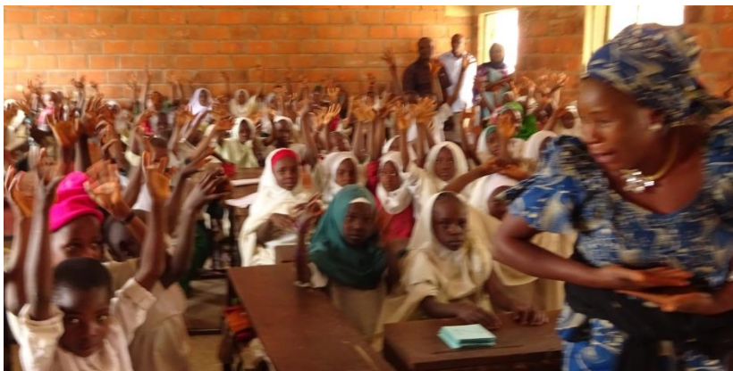
Photo: sign language lesson in a crowded classroom in Kajuru School, Kaduna.

Four teachers focused on hearing impairment. They supported the learning of hearing impaired children using sign language, and also taught sign language to entire classes. This enabled children to communicate with each other.