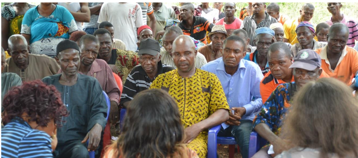
SBMC and community members in discussion with the review team, Neko Uno School, Enugu.