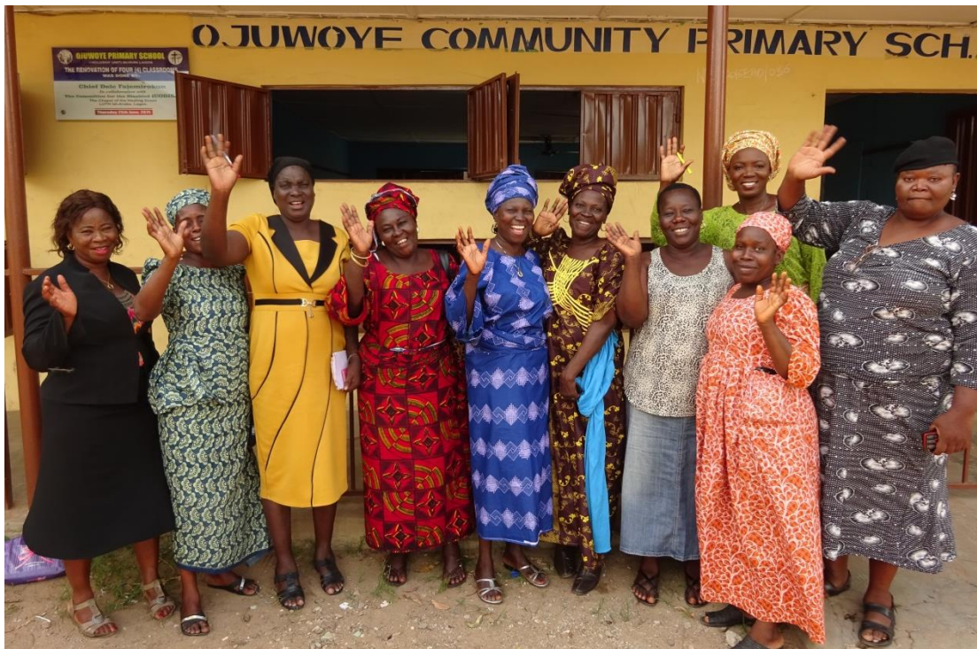
Photo: The Women's Committee at Ojuwoye School, Lagos

In the second disability-focused local school visited in Maryland, Lagos, most of the children present appeared to have hearing and speech difficulties, rather than severe mobility or learning disabilities. This school did not have an ESSPIN-supported SBMC or women's committee.