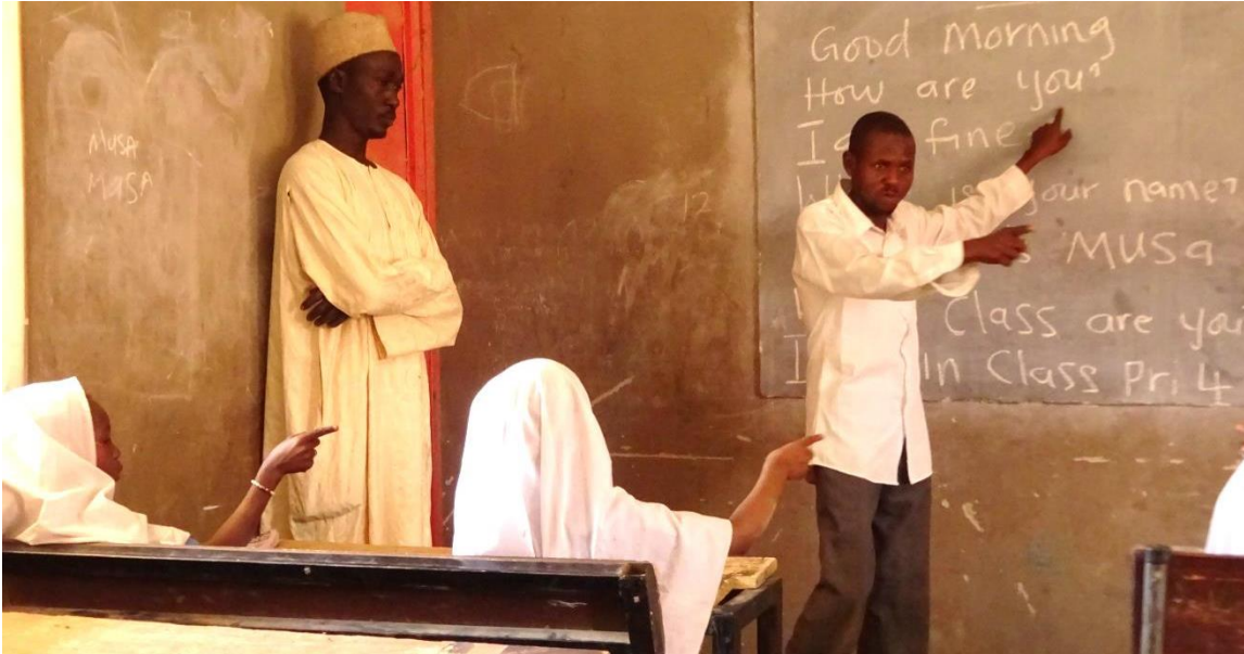
Photo: sign-medium teaching of hearing impaired children in Gobirawa School, Kano

In Lagos, inclusive local schools have been rolled out since 2006 under a state policy aim to bring education for disabled children out of separate schools. While five boarding special schools remain, there is one or two inclusive local schools in each LGEA, totalling 31. The state inclusive education committee reported regularly visiting these schools to monitor and improve them.